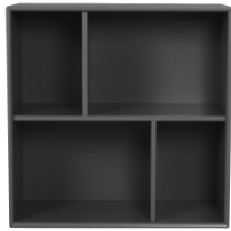
Dark grey -014