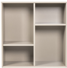
Fog grey -009